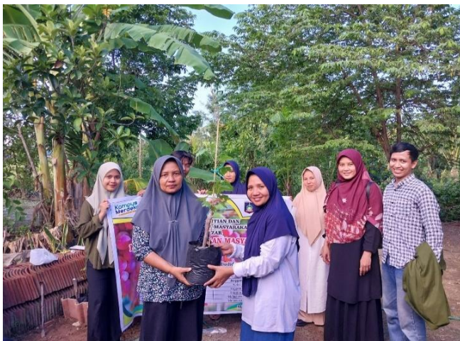
Figure 4. Documentation of Handover of Grape Seedlings

The training activities carried out aim to provide direct knowledge related to the method of planting grape seedlings, grafting and making good planting media for grape seedlings. The training activities were attended by all KWT members and were very enthusiastic in implementing them until the end of the activity.