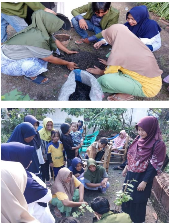
Figure 3. Training Implementation Documentation