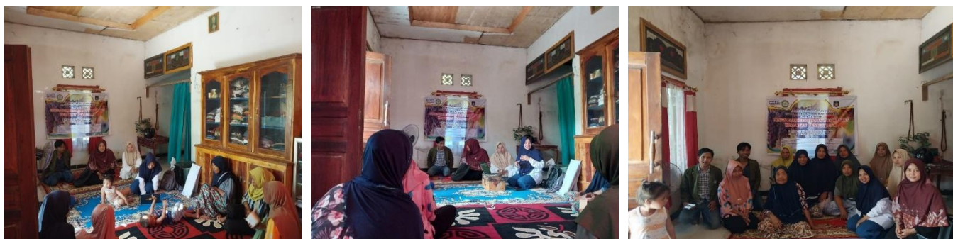
Figure 2. Documentation of Extension Implementation

Extension activities are carried out with the aim of partners having additional information and knowledge related to grape cultivation techniques, types and benefits of grape plants that can increase the partner's economy. In this activity, the PKM team collaborates with the Village Head and Partners in its implementation, this aims to provide non-formal education for partners in grape cultivation techniques.