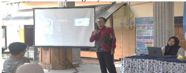
Figure 2. Socialization from the Cooperative & Micro Business Office of Sidoarjo Regency

In this socialization, we from the Cooperative & Micro Business Office of Sidoarjo Regency were asked by the Central Statistics Agency of Sidoarjo Regency to provide socialization about the importance of Business Identification Numbers in the business continuity of micro business actors, as well as the delivery of material that is expected to open the eyes of the participants who participated in this socialization and mentoring activity.