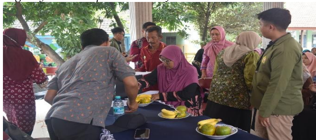
Gambar 3. Assistance in Making NIB