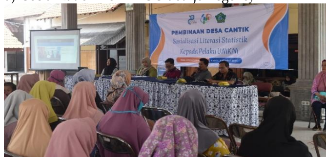
Figure 1. Socialization from BPS Sidoarjo Regency

In this socialization, BPS conveyed several things that educated the micro business actors who attended, where BPS explained about beautiful villages (Cinta Statistik) where this program is very useful in the future, especially for residents who want to know the data of their villages or other regions to come up with innovations in the establishment of their businesses, how to access data from BPS which is actually very easy to do anytime and anywhere, and provide a service flow that residents can do if they ask for help from village officials in requesting data from BPS.