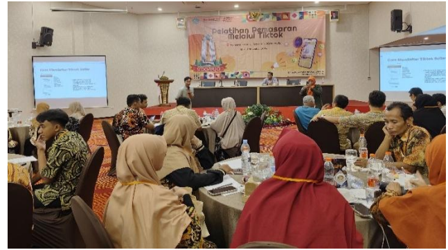
Figure 1. Submission of the 1st Material About the Registration Stage to Upload Products at Tiktok Shop.

The following are the stages of training that was attended by Sidoarjo MSME players on November 12-13, 2024 at Samara Hotel, Batu City with the theme Marketing Training Through Tiktok.