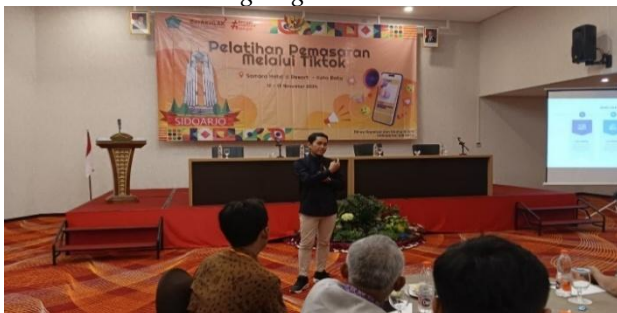
Figure 2. Delivery of the 2nd material about optimizing product marketing in Tiktok Shop.

Product marketing via Tiktok Shop can be done both within the Tiktok app and outside the app. Sellers have the option to utilize the Tiktok Shop voucher