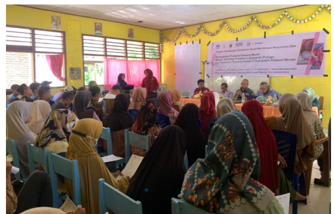
Figure 1. The atmosphere of implementing community service activities

The extension activities were carried out for one day, starting at 08.00 - 16.00 WITA which took place in the classroom of SDN 092 Pupenga, Galung Village, Lombok. The implementation of the extension activities was carried out by presenting material on double production (PROLIGA) of shallots using True Shallot Seed (TSS), as well as informing the advantages and disadvantages of this method compared to the application of previous shallot cultivation techniques. This activity also showed shallot seeds from seeds and showed the results of the application of the TSS method on red.