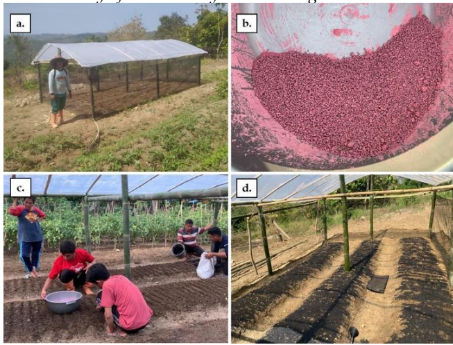
Figure 3. a) nursery facilities for Abadi farmer group, b) red onion seeds (TSS) ready to be sown, c) TSS sowing in KWT Seruni nursery, d) TSS has been sown

As an effort to sustain this extension, both target groups received facilities in the form of a nursery (seedling house) for shallot seeds. Through the construction of these facilities, the target groups can apply the knowledge gained in the extension. These nursery facilities are the initial steps taken to implement increased shallot production based on TSS. Members of the farmer groups and women's farmer groups can develop seeds that have been sown on their respective lands.