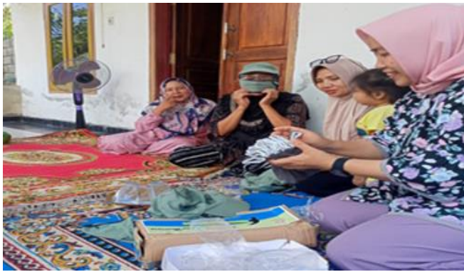
Figure 7. Handover of Tools to Partners