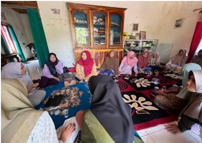
Figure 3. Socialization Activities

The implementation of this service aims to empower the community, especially female stone workers on Mount Balibe in Bonder Village through counseling and training related to the environment, technological innovation in the use of mining waste stones and financial and business management. The socialization activity was carried out in the form of a discussion involving ten female stone workers and the Entrepreneurial Partnership Service (PKW) team and five students from Al-Azhar Islamic University. The socialization was carried out by providing information to the community, especially female stone workers, regarding the potential of mining waste as raw materials for crafts and providing an understanding of the importance of preserving the environment and utilizing resources wisely.