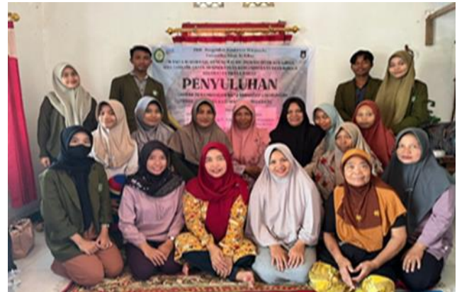
Figure 4. Extension activities

which are ultimately expected to improve the welfare of female stone workers so as to contribute to sustainable village economic development. (Hariyono, 2020).