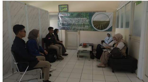
Figure 3. Coordination with Related Parties

Coordination with related parties is an important step in ensuring the smoothness and success of the community service program. This activity involves communication and cooperation between the team, community partners, and supporting institutions.