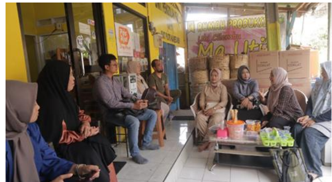
Figure 2. Identification of Partner Needs Initial