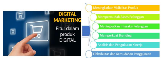
Figure 4. Digital Marketing Application Specific to Cilembu Sweet Potato Products.

branding, increase customer interaction, and expand distribution networks (Akram et al., 2020).