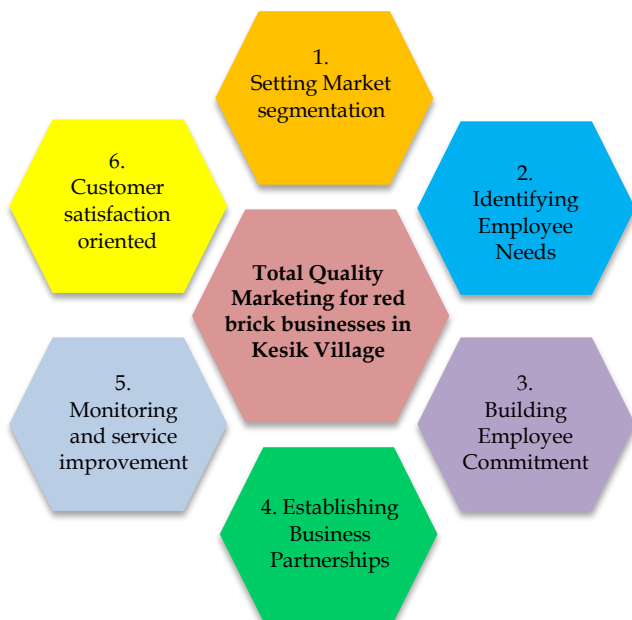
Figure 2. The implementation model of Total Quality Marketing (TQMk) for red brick businesses in Kesik Village

The implementation of TQMk for red brick businesses in Kesik Village, based on the above explanation, can be depicted in a model as shown below (Figure 2)