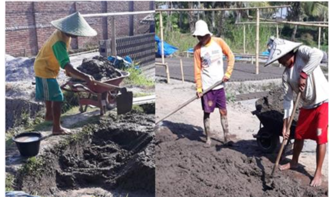
Figure 1. The process of mixing materials and refining

evidenced by the increasing number of businesses, with some even operating on a larger scale.