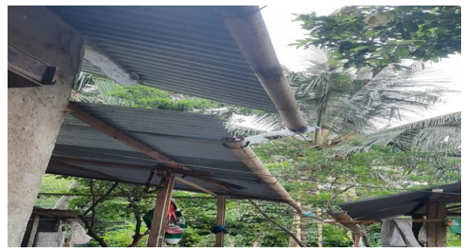
Figure 2. Rainwater Capture System from the Roof of the Building

The rainwater that will be collected into the reservoir is collected from the roof of the house. Rainwater from the roofs is channeled into a reservoir using materials such as split paralon pipes and can also use bamboo available at the location. The drainage system is designed simply, where pipes and split bamboo are simply hung with hooks and the slope is adjusted so that it can flow into the reservoir.