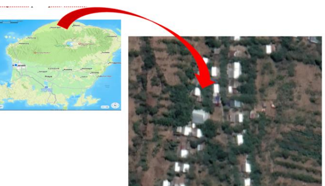
Figure 1. Location of Activities