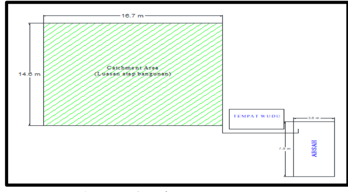
Figure 4. Plan of Rainwater Storage

Various types of rainwater storage models are commonly used, namely using prefabricated plastic reservoirs, using brick masonry, cast concrete and the simplest one using plastic tarpaulin. In general, the water collected comes from rainwater which is collected through roofs and channeled to reservoirs using pipes or using bamboo. However, in several places far from residential areas, the water collected is surface runoff which is channeled into storage tanks. During the socialization, a model with bricks was introduced which was equipped with a filter tank which functioned to purify the water. The following is a model of an artificial aquifer that was socialized in the Panggung Barat hamlet, Selengen Village.