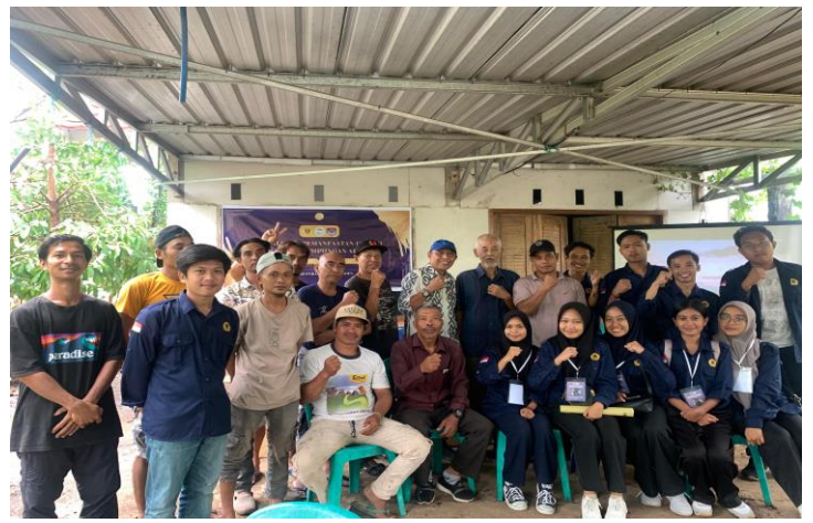
Figure 8. Photo Session with Resource Persons and Socialization Participants