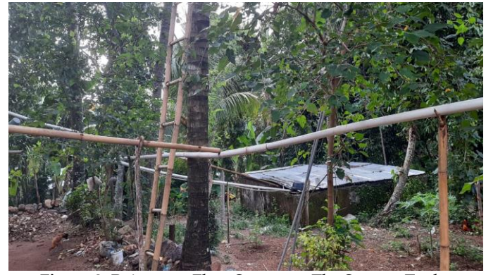
Figure 3. Rainwater Flow System to The Storage Tank

Figure 2. Rainwater Capture System from the Roof of the Building