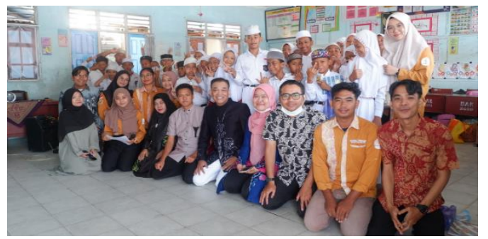
Figure 2. Taking a group photo with the service team, teachers and students at SDN Cerucuk V

Throughout the activity, the students showed good enthusiasm, as seen from their responses to the questions posed by the students. In addition to educational activities through lectures, the service team also prepared posters to internalize students' knowledge. Posters are a form of publication media consisting of text and images containing disseminable information. Posters play a role as informative media packaged with an attractive appearance so that students can recognize their meanings (Pradana et al., 2022; Wicaksana et al., 2020). Posters are part of educational media containing concise, clear, and communicative sentences accompanied by attractive designs and colors for readers. Posters are placed in the classroom to be read by all students in each class. The contents of the posters include "Keep the classroom clean," "Don't forget to water the plants," and "Do not pluck plants indiscriminately." The poster can be seen in Figure 2.