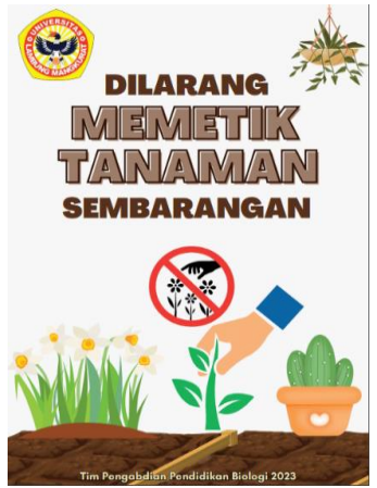
Figure 2. Example of a poster given to SDN Kuin Cerucuk V in Banjarmasin

Throughout the activity, the students showed good enthusiasm, as seen from their responses to the questions posed by the students. In addition to educational activities through lectures, the service team also prepared posters to internalize students' knowledge. Posters are a form of publication media consisting of text and images containing disseminable information. Posters play a role as informative media packaged with an attractive appearance so that students can recognize their meanings (Pradana et al., 2022; Wicaksana et al., 2020). Posters are part of educational media containing concise, clear, and communicative sentences accompanied by attractive designs and colors for readers. Posters are placed in the classroom to be read by all students in each class. The contents of the posters include "Keep the classroom clean," "Don't forget to water the plants," and "Do not pluck plants indiscriminately." The poster can be seen in Figure 2.