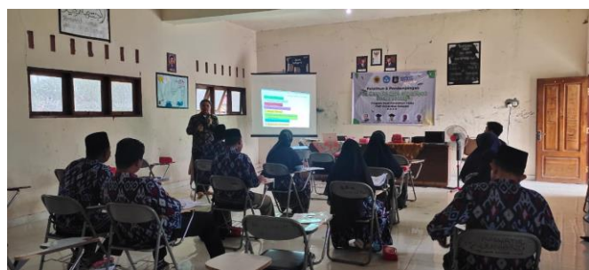
Figure 4. Assistance activities for preparing CAR

Training activities and assistance in preparing CAR articles are really needed by a teacher to publish findings during learning. Scientific work in the form of articles that can be published in journals is one of the important things that a teacher must do to develop themselves. Creating scientific work is also one of the demands that teachers must carry out in order to become professional teachers. Therefore, teachers are increasingly motivated to take part in this activity from start to finish. The number of participants who take part is 100% complete.