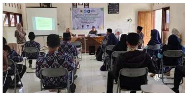
Figure 2. CAR preparation training activities

The implementation stage is the core stage of this service activity. This activity was attended by twelve subject teachers at Attohiriyah Bodak High School. This activity was carried out through two sessions, namely a training session and a mentoring session.