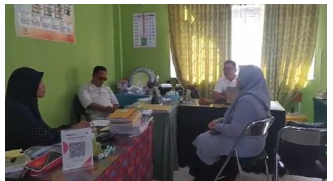
Figure 1. Socialization of Community Service Activities

The science practicum training was carried out starting with the observation stage of science laboratory management at Muhammadiyah Langsa High School. Laboratory observations were carried out by inspecting the Muhammadiyah Langsa High School laboratory. This laboratory review is carried out by checking the completeness of the practicum tools, as well as the completeness of the materials needed in carrying out the practicum. In this case, a meeting was also held with the vice principal of the curriculum field to discuss the schedule and participants who would be given training on the use of science laboratory equipment.