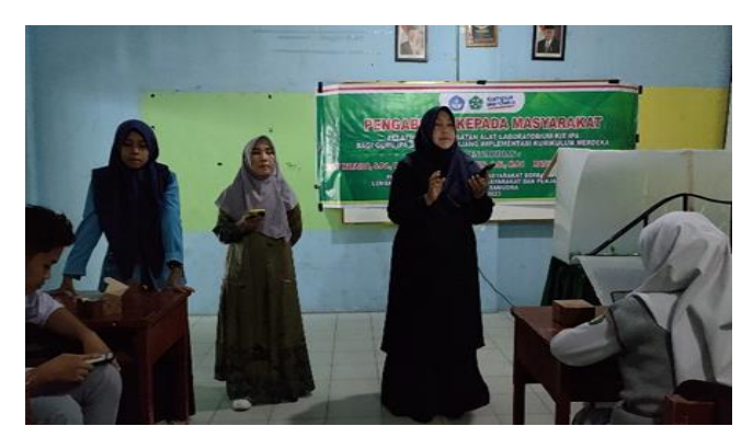
Figure 2. Stage of explaining the purpose of community service activities

The results obtained at this stage were teachers and students enthusiastically paying attention, listening and hearing the PkM Team's explanation of the objectives of the training activities that would be given to teachers and students. Next, entering the second stage of activities, the PkM Team provided an explanation of the tools that had been to the Deputy Principal aiven of SMA Muhammadiyah Langsa for the Curriculum Section so that they could be used in practical biology, physics and chemistry learning. Proof that PkM activities have been implemented can be seen in Figure 3.