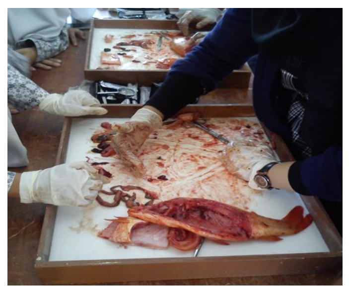
Figure 4. Animal Anatomy Practicum

The PkM team explained step by step the use of the physics practical tool for building a roller coaster in using the tracker application for GLB and GLBB practicum, so that teachers and students know the function of the tool. At the next meeting, the PkM Team explained and provided material on animal anatomy biology and genetics learning, as seen in Figure 4 and 5.