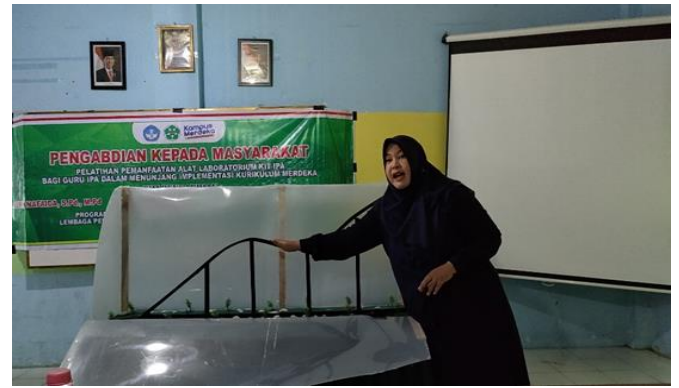
Figure 3. Physics Practical Tools for Roller Coaster Design

The results obtained at this stage were teachers and students enthusiastically paying attention, listening and hearing the PkM Team's explanation of the objectives of the training activities that would be given to teachers and students. Next, entering the second stage of activities, the PkM Team provided an explanation of the tools that had been to the Deputy Principal aiven of SMA Muhammadiyah Langsa for the Curriculum Section so that they could be used in practical biology, physics and chemistry learning. Proof that PkM activities have been implemented can be seen in Figure 3.