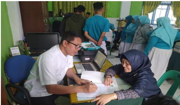
Figure 1. Preparatory Stage for Implementation to SMA Muhammadiyah Langsa

In the preparatory stage carried out by the Community Service Team, the first carried out the application for service permits and assignment letters submitted to the LPPM and PM Samudra University as document administration to carry out community service activities. Furthermore, the Service Team carried out outreach activities to representatives to schools in the field of curriculum at Langsa Muhammadiyah High School which aimed to carry out community service activities. In this case the school agreed to the process of community service activities and allowed the implementation of these activities at Langsa Muhammadiyah High School. The process of proving this activity can be seen in Figure 1.