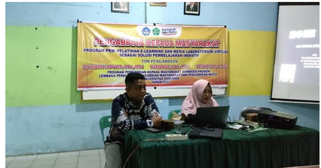
Figure 2. Opening of Community Service Training

independent curriculum was implemented. Next, material was delivered and training was carried out for teachers in utilizing virtual laboratories as a medium to support the implementation of the independent curriculum. After that, the Head of the Service Team provided training material regarding the Merdeka curriculum and virtual laboratory media in the physics study field practicum. As for proof that this service activity was carried out, you can see Figure 2.