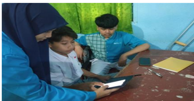
Figure 5. Students Practice Virtual Laboratory Applications

Regarding figure 4 above, the teacher practices virtual laboratory media applications regarding practical learning in physics, chemistry and biology. Next, we can see the practices carried out by Muhammadiyah Langsa High School students, which can be proven in Figure 5.