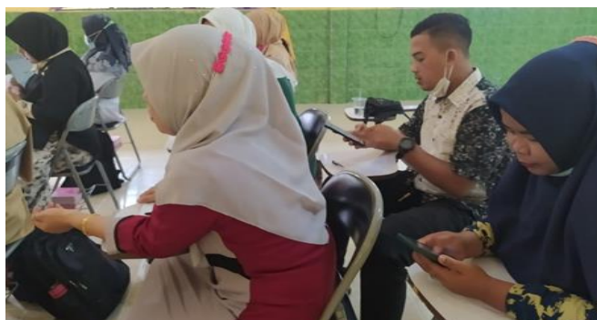
Figure 4. Teachers practice virtual laboratory applications

Regarding figure 4 above, the teacher practices virtual laboratory media applications regarding practical learning in physics, chemistry and biology. Next, we can see the practices carried out by Muhammadiyah Langsa High School students, which can be proven in Figure 5.