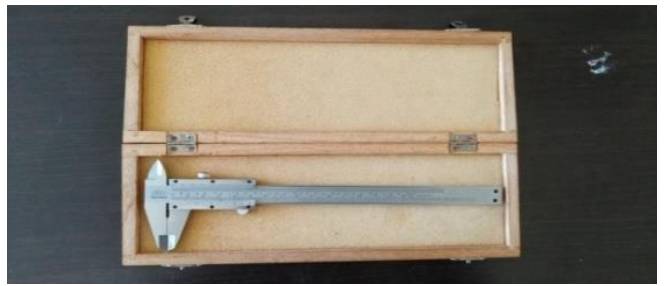
Figure 1. Caliper

The shape of the caliper can be seen in Figure 1.