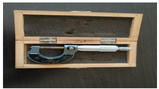
Figure 3. Micrometer screw

A screw micrometer is a measuring tool capable of measuring the thickness of objects and has an accuracy of 0.1 mm. objects that can be measured using a screw micrometer are metal plates and ball diameter. The shape of the screw micrometer can be seen in Figure 2.