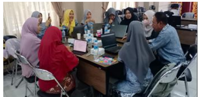
Figure 2. Discussion on Preparation for Research Curriculum Innovation Training

In the planning stage, online discussions were held to discuss the time, venue, organizing committee, participant selection, and catering for the event. The discussion was concluded on October 29, 2025, in the Balikpapan Ministry of Religious Affairs Hall from 7:30 a.m. to 5:00 p.m. WITA (Central Indonesian Time), with 25 participants, comprised of the Head of Madrasah Education, teachers from MTsN 1, MTsN 2, and MAN Balikpapan. The following is a participatory discussion between teachers and the deputy principal regarding the planning of the research curriculum innovation.