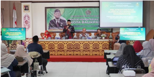
Figure 3. Opening of Grassroots Curriculum Innovation Training

This phase is the implementation of grassroots curriculum innovation training that integrates research into local content subjects within the implementation of the independent curriculum. The following is documentation of the opening of the training by the Head of the Balikpapan City Ministry of Religious Affairs Office.