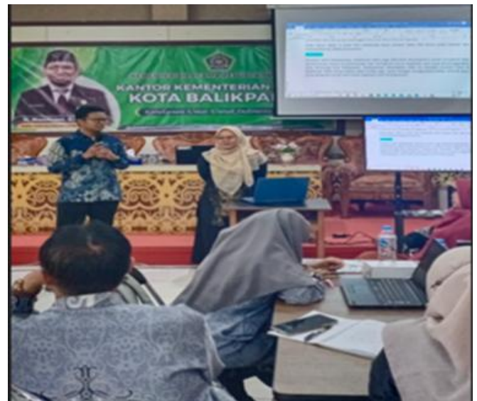
Figure 5. MTsN 2 Group Presentation Reflection Stage

The change phase represents the real transformation phase of the entire PAR-based training process. After undergoing in-depth reflection, teachers not only recognized the importance of research and local content in learning but also began to reorganize the curriculum innovation at the madrasah. At this phase, the results of the reflection were implemented into corrective actions, both in the form of revised curriculum documents and in more contextual and participatory learning policies. Teachers act as agents of change, bringing innovative ideas for curriculum development, and madrasahs become spaces for the growth of research learning in the implementation of the independent curriculum. This requires improvements to research themes, teaching modules, syllabi, and student worksheets, the implementation of project-based learning, and improvements to teachers' pedagogical competencies. A paradigm shift from assignment-based learning to inquiry-based learning is needed, and an institutional commitment to making research learning part of the culture of superior madrasahs is being built. The following is documentation of the presentation of the results of improvements in the development of the research curriculum, from MTsN 2 Balikpapan.