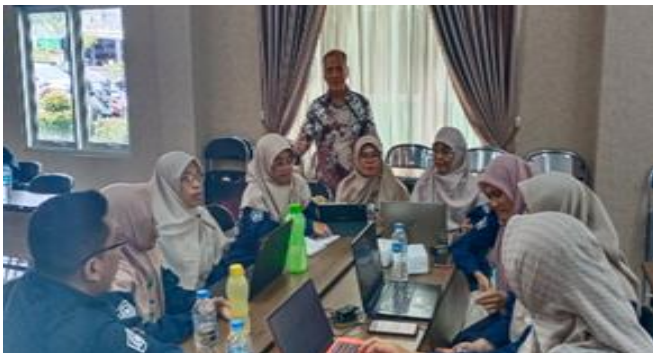
Figure 4. Grassroots Curriculum Development for the Independent Curriculum

The training took place in the Balikpapan Ministry of Religious Affairs Hall, coordinated by the Head of Madrasah Education and the Principal of Balikpapan State Islamic Senior High School (MAN Balikpapan) from the three participating madrasahs. The material was delivered according to the activity schedule, followed by the process of developing grassroots-based curriculum learning components integrated with the love-based curriculum. The following is documentation of the group work from MTsN 1 and MTsN 2 Balikpapan.